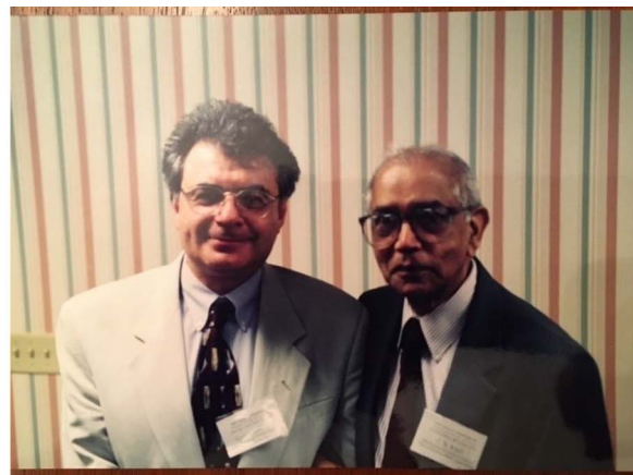
FIG. 4. Lukacs Professorship at BGSU with C. R. Rao, 1999.