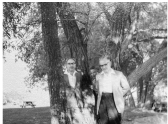
FIG. 3. Alfréd Rényi and Eugene Lukacs (circa 1960).