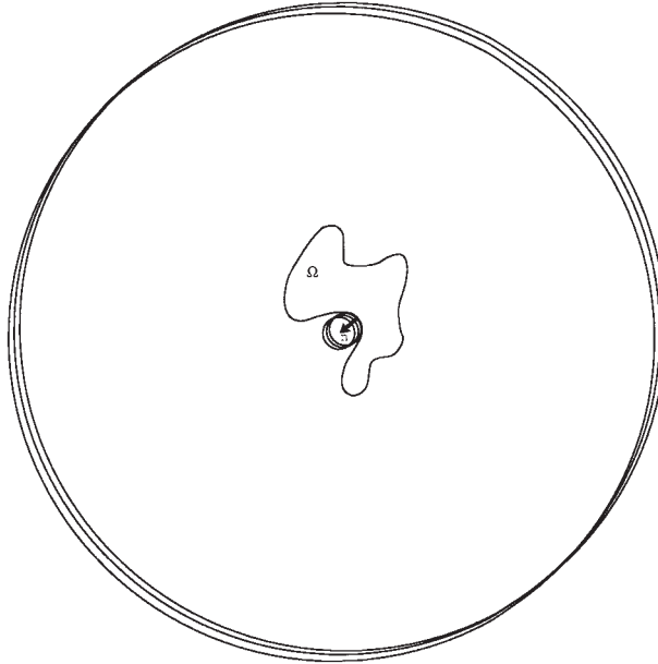
Fig. 4.2. The annuli where the subsolutions are supported

Moreover, R_2 can be taken arbitrarily large. In Figure 4.2 we have represented these annuli.