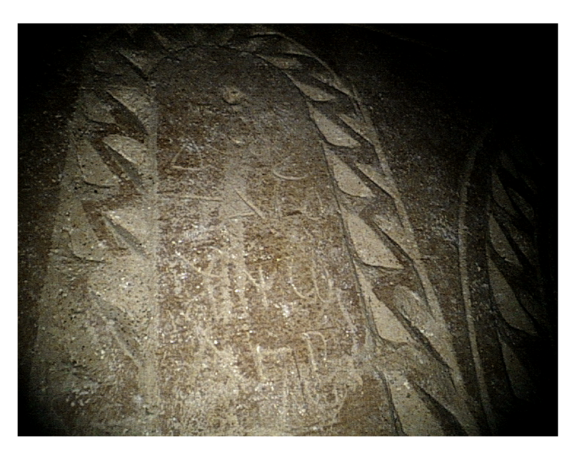
FIG. 2. Front of Ossuary #2 (unenhanced photograph) showing four-line inscription between rosettes. The fisheye distortion in this image is due to narrowness of the passage between that ossuary and the niche's wall.