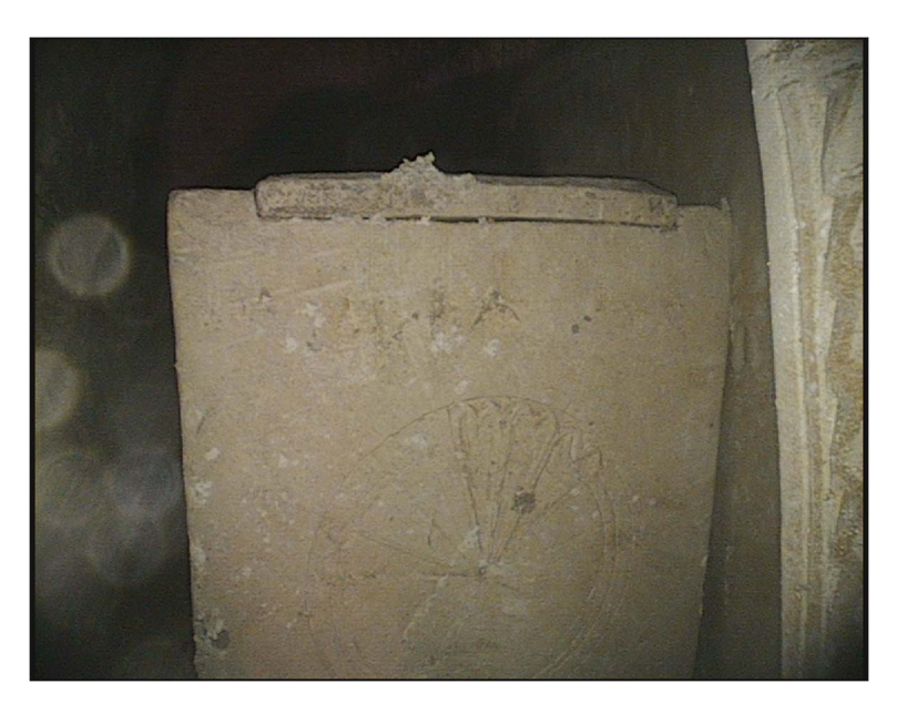
FIG. 3. Ossuary from Tomb 1 with the Greek inscription.