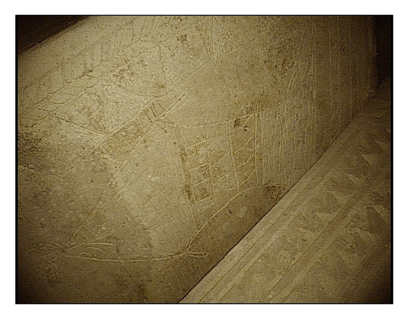
FIG. 1. Front left half of Ossuary #1 (unenhanced photograph, rotated).

upper case Greek script. The first three lines appear to read:<sup>7</sup>