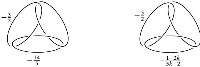
Figure 1: Surgery presentation for all (distinct) hyperbolic knots with two lens space fillings obtained by surgery on the minimally twisted 5–chain link

Given an orientable cusped hyperbolic 3–manifold M and a fixed torus component \tau of the boundary of its compactification, it is a consequence of Lackenby and Meyerhoff [20] that 8 is a universal upper bound for \Delta(\alpha_1, \alpha_2) for each exceptional pair (M, \tau; \alpha_1, \alpha_2) . The celebrated Gordon–Luecke theorem [16] can be formulated by saying that \Delta(S^H, S^H) = 0 , the cabling conjecture by saying that, as a maximum over an empty set, \Delta(S, S^H) = -\infty (see González-Acuña and Short [13]), the Berge conjecture implies that the Berge knots in [5] contain all exceptional pairs of type (S^H, T^H) , and the theorem of Gordon and Luecke [18] by saying that the knots realizing \Delta(\alpha_1, \alpha_2) = \Delta(S^H, T) are precisely the Eudave-Muñoz knots. The examples of exceptional (T^H, T^H) , (T^H, T) and (T^H, Z) pairs in Culler, Gordon, Luecke and Shalen [8], Gordon and Luecke [18] and Boyer and Zhang [7] are all obtained by surgery on 5CL, while the examples of exceptional (T^H, T^H) pairs in Dunfield, Hoffman and Licata [9] are not.