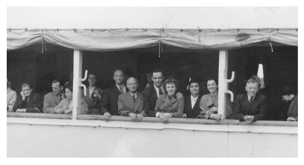
FIG. 2. Holland America Line (trip from Rotterdam to Hoboken, New Jersey).-early September 1953.