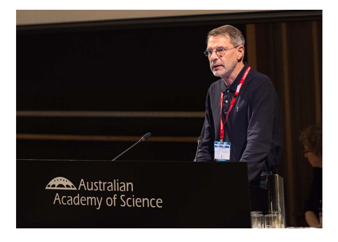
FIG. 1. May 2018: Press photo, Australian Academy of Science lecture.

nity. I think my work has been appreciated within the statistics community, but it's special to become a Fellow of the Australian Academy (FAA), because they only elect 20 per year from all disciplines.