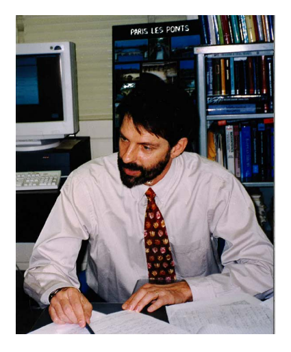
FIG. 6. 1993: Press photo, Distinguished Professor of Liberal Arts and Sciences, Iowa State University.