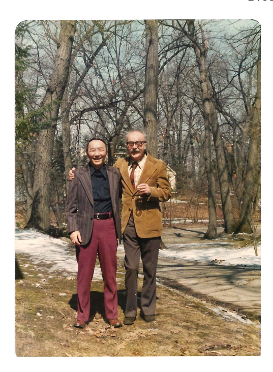
FIG. 1. With George Box in the 1960s.

the time I got to England I think I got more and more interested in time series.