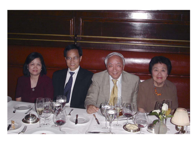
FIG. 7. With Tsays in 2003.

involved in environmental data my application background in economics actually helped me to get into other areas. So that way we can probably expand our Master program.