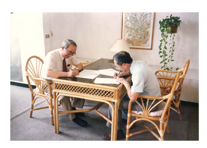
FIG. 5. Signing agreement of Statistica Sinica in 1987.