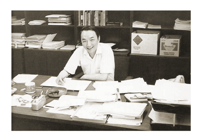
FIG. 4. Chairman of the department of statistics, Wisconsin, in 1974.

Once we knew what would happen to the canonical correlations when the series approach nonstationarity, I thought that we could publish the paper. But then the surprising thing was the following. I remember in 1977 Box came to my basement in Madison to work on the paper. As we reworked the Hog example and looked at the components, after you transformed them, you see one or two is very nonstationary, but we also see that there are two components very much like noise. First we dismissed that. All we really wanted are the one nonstationary components because they explained the growth. But then we looked at two noise components and played with them for quite a bit and tried various combinations to explain the components. Finally, we worked out that the two components, by making some transformation, you get some economic sense out of them. And after we got that, we say, hey, this is really interesting. The stable component was a complete surprise, because at the beginning we didn't work that way. We didn't think that way, either. We thought it's important to find the thing that underlines the growth. But then it turns out that the stable components become very interesting at the end because they have economic meanings.