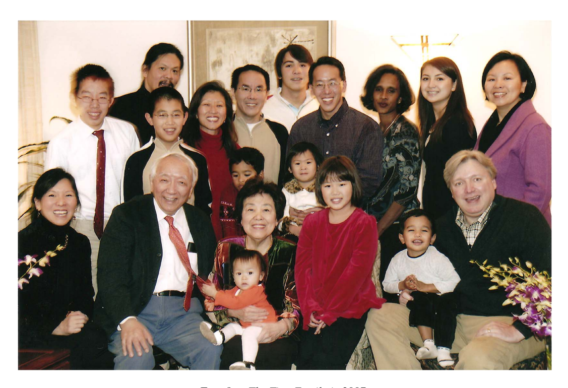
FIG. 8. The Tiao Family in 2007.

When I was young I used to play a lot of bridge and also learned to play golf. But in the last 30 years I have basically given it all up. I was fortunate, because I was really brought up in one culture and then adopted another culture. I still go back to China and Taiwan very often. So I continually kind of like live in both, both are