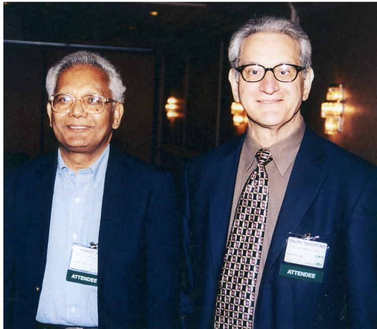
FIG. 8. Pranab Sen and Ralph D'Agostino at the Noether Lecture, Joint Statistical Meetings, 2002.

normality was not achieved. This inspired me to develop nonparametric methods for biological assays. The 1963 Biometrics paper (Sen, 1963a) was probably the very first nonparametric one in bioassay. I observed that because ranks are invariant under arbitrary strictly monotone transformations, an estimator of the relative