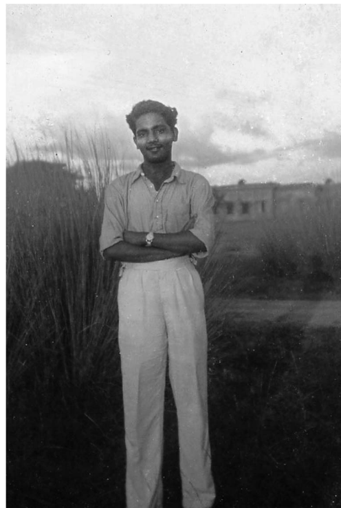
FIG. 2. While in Presidency College, Calcutta, 1954.