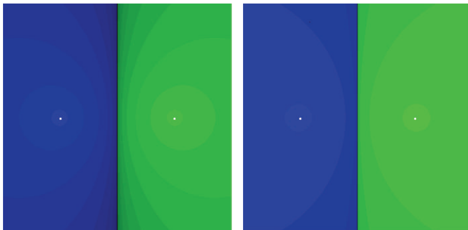
FIGURE 1: The basins of attraction for (5) (left) and (6) (right), for the polynomial x^2 - 1 = 0 (shaded by the number of iterations to obtain the solution).