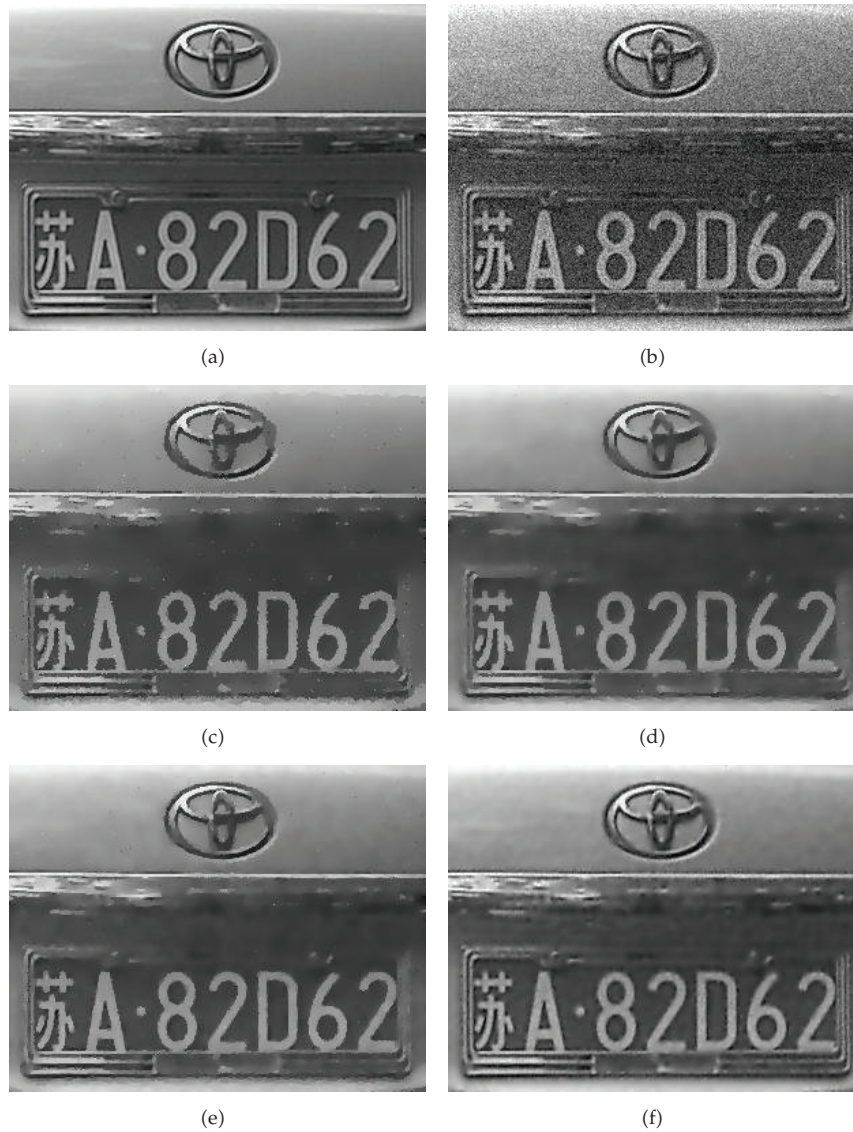
Figure 3: Comparison of different methods on “License plate” image. (a) Original image. (b) Noisy image. (c) PM smodel with k = 10 . (d) TDE model with k = 10, \lambda = 40 . (e) ITDE model with k = 10, \lambda = 40, \sigma_1 = 0.1 . (f) Proposed fourth-order TDE with k = 1, a = 4, \lambda = 10 .