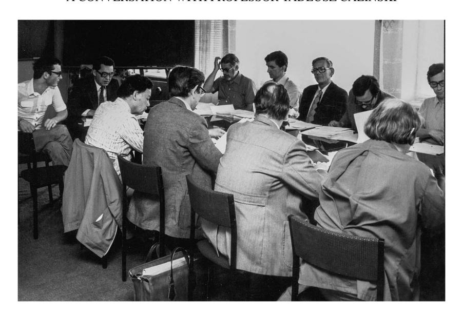
Fig. 9. First Working Seminar on Statistical Methods in Variety Testing (1979).

linear spaces. This is a wide spectrum of interests for one department.