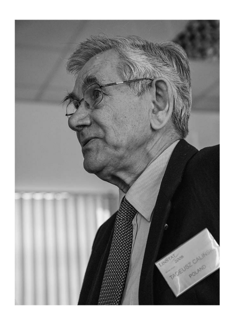
FIG. 10. Tadeusz Caliński at LINSTAT 2008.

So, I joined this committee and I gave an exposé on problems of mathematical statistics, urging support for its development, which was favorably received. A few months later, a commission was created for development of mathematical statistics in Poland. I became a