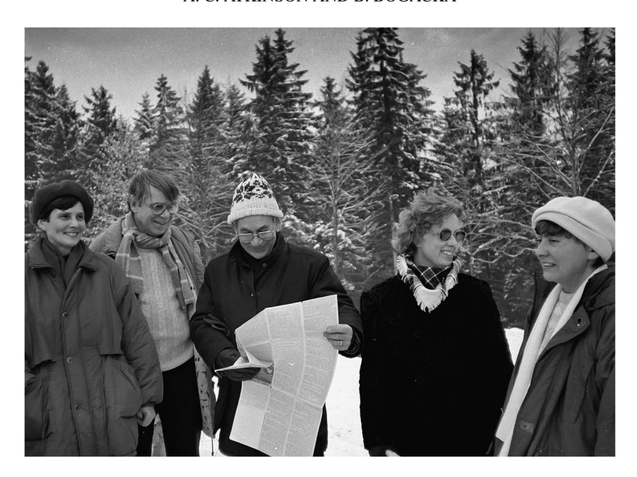
FIG. 7. During one of the Wisła conferences (1995).

meeting was that I wanted to see famous people whom I knew from the literature, particularly Anderson and Scheffé.