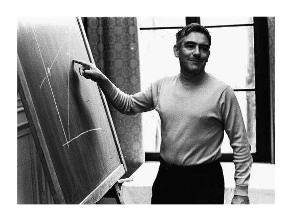
FIG. 5. Schloss Reinhardsbrunn, German Democratic Republic, 1975. Peter discusses leverage points.

this direction, one cannot go further. Optimality tells us under what conditions there are limits to how well a method can perform, and if a method is close to but not perfectly optimal, this might be as well.