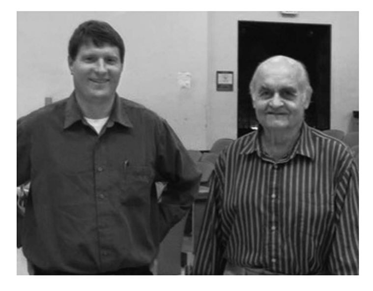
FIGURE 2. Wolfgang Haken and Ian Agol in Altgeld Hall 314 in May 2014.