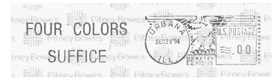
FIGURE 1. The "Four Colors Suffice" postmark used by the UIUC Department of Mathematics after the Appel-Haken proof.

admits a finite cover which is a Haken manifold. The Virtual Haken Conjecture informed much of the subsequent development of 3-manifold topology and geometric group theory. The conjecture was recently proved by Agol [1], with a substantial portion of the proof relying on the work of Wise, and of Kahn and Marković.