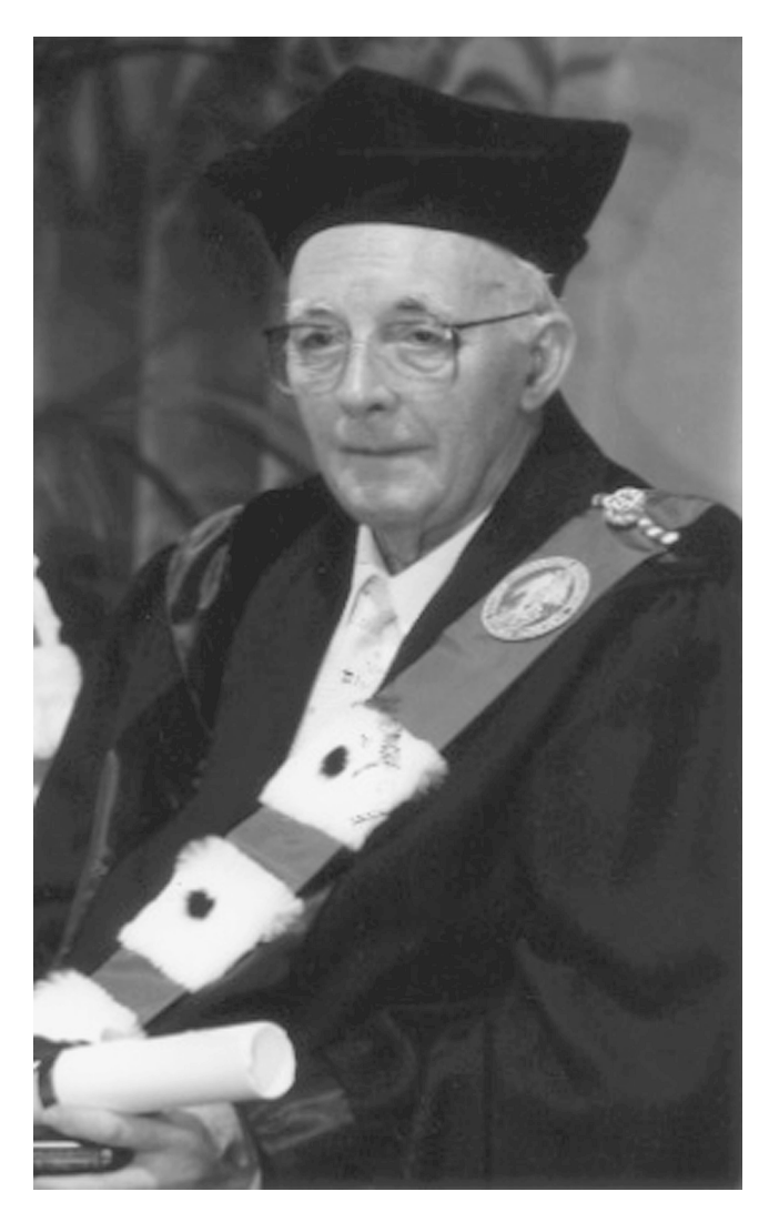
FIG. 13. Honorary Degree of Science, Université Libre de Bruxelles, Brussels, Belgium, February 1997.

I don't know, I really don't know what is going to happen.