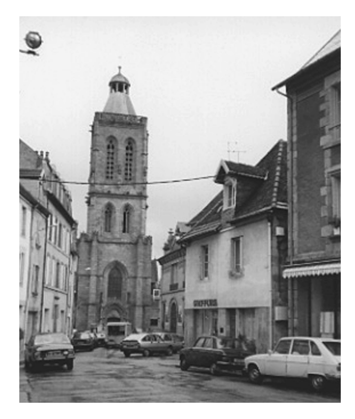
Fig. 2. Le Cam grew up in Felletin, a little town in central France, current population 5,000.

students for all the grades, except those of us in the highest two grades, were scattered out in the countryside. The top two classes were in the basement of a church. I passed the state graduation exams given nationwide. Then the director of the school decided that I was a good prospect for a seminary. So I went to the seminary.