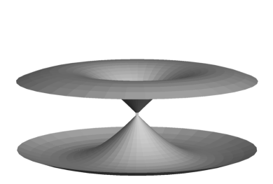
Figure 2. The left figure is a maximal catenoid which is a maxface with conelike singular points. The right figure is a maximal helicoid which is the conjugate of a maximal catenoid. Its singular point set consists of fold singular points.