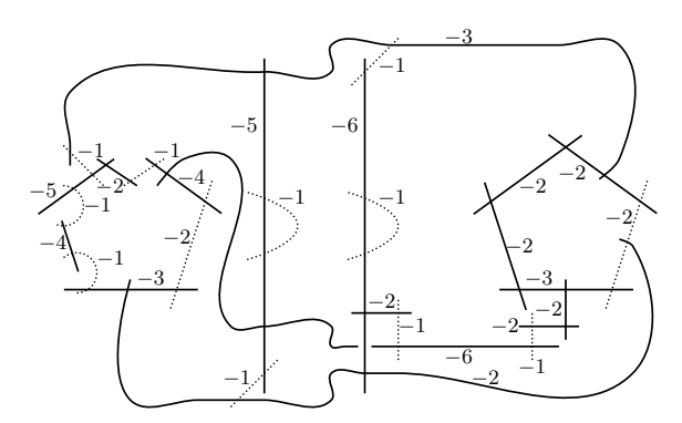
(d) Z = E(1) \ddagger 14 \overline{\mathbb{P}^2} . C_{2,1} : (-4) . C_{3,1} : (-5, -2) . C_{7,4} : (-2, -6, -2, -3) . C_{65,17} : (-4, -6, -5, -3, -2, -2, -2, -3, -2, -2) .