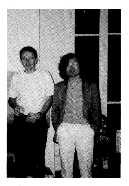
Fig. 3. Masaki Kashiwara and myself around 1980

Moreover, constructible sheaves on a real manifold are sheaves whose microsupport is subanalytic and Lagrangian. This allowed Kashiwara to adapt to the real case the notion of characteristic cycle of a \mathcal{D} -module and to define the Lagrangian cycle of an \mathbb{R} -constructible sheaf. The group of Lagrangian cycles is isomorphic to the Grothendieck group of the abelian category of \mathbb{R} -constructible sheaves and is also isomorphic to the group of constructible functions. Lagrangian cycles play a basic role in many questions and have been recently extended to higher K-theory by Beilinson [2].