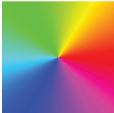
FIGURE 1. A phase portrait of f(z) = z (color figure available online).

We would like to mention that our interest in sums of the Riemann zeta function on arithmetic progressions has also been motivated by phase portraits .