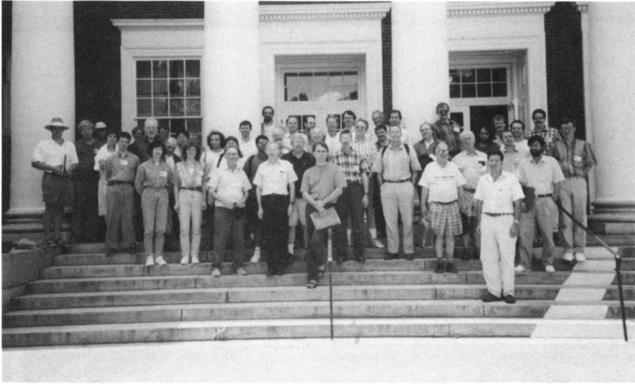
Pictured above are some of the participants who attended the conference in Charlottesville.