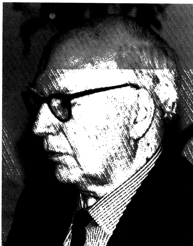
Maurice Bartlett in 1982; photo taken from volume "The Making of Statisticians." From Springer-Verlag.

Bartlett: I only wish I had known the work of M'Kendrick earlier because when I first wrote and lectured on stochastic processes, I wasn't aware of his work. The first edition or so of my book on stochastic processes doesn't mention M'Kendrick. I think it was