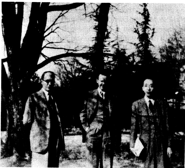
Hsu with M. S. Bartlett (left) and H. Cramér in Chapel Hill, December 1946.

When I had to teach statistics, obviously, I was very concerned to bring in the Neyman-Pearson theory, but I would not have stretched it out to an enormous length in the whole course because it might place an unnecessary emphasis on that aspect.