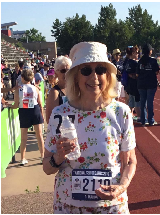
FIG. 8. At the National Senior Games in Albuquerque, June 2019, waiting for the W1500 racewalking event to begin.

and a simulated forecast. I was trying to show that you could estimate two free parameters in the barotropic vorticity equation along with other tuning parameters.