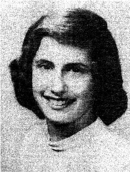
FIG. 1. From the 1952 Yearbook, Montclair High School, New Jersey.