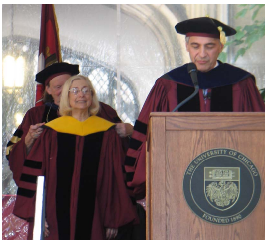
FIG. 4. Receiving the honorary D.Sc. hood, University of Chicago, 2007.