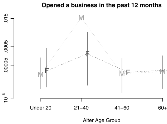
FIG. 2. Estimates of latent profiles for individuals starting their own business. Letters correspond to posterior medians, while lines represent the width of the middle half of the posterior distribution. The lighter text represents males and the darker text females. Overall estimates are higher for males than for females, with the largest discrepancy for young adults.

ARD. Our estimates are especially consistent with the case of males being more isolated than females before committing suicide.