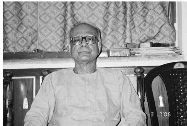
FIG. 6. Shoutir Kishore Chatterjee, July 2006.

Chatterjee: Research problems in statistics in their original form—I am excluding derived problems—always have reference to an empirical entity that looms in the background. This is the main difference between a research problem in statistics and one in pure mathematics. The principal objective of training a statistician should be to inculcate in the person a data sense; that is, a statistician should be instinctively able to replace the empirical entity at the back by numbers representing its various features. For developing this data sense, both theoretical studies and exposure to practice are necessary. Once somebody develops this data sense, he or she can pursue theoretical research or work in a statistical office, depending on his or her situation.