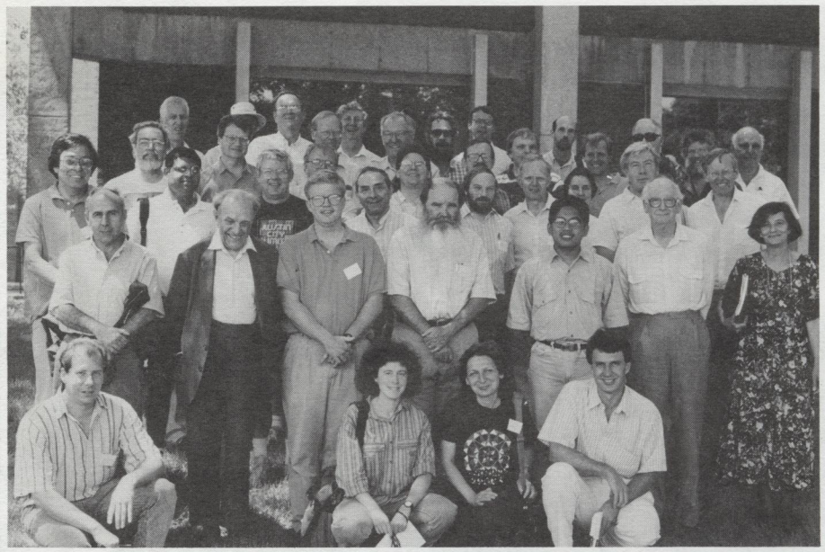
Those participants who were able to return from lunch by the appointed hour are pictured above.