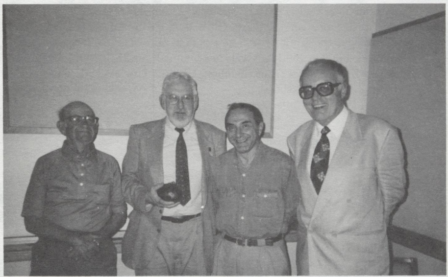
Above we have a photo of the four principle speakers at the conference. The picture was taken at the banquet.