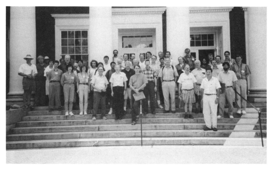
Pictured above are some of the participants who attended the conference in Charlottesville.