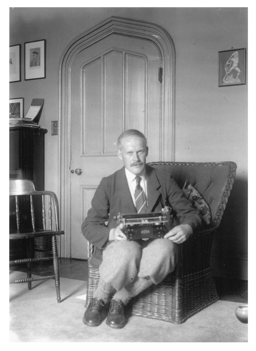
FIG. 3. Sir Harold Jeffreys (1891–1989) in 1928.

gives any ground for inferring a difference between the corresponding ratios in the complete populations. Let us suppose that in the first population the fraction of the whole possessing the property is [\theta_0] , in the second [\theta_1] . Then we are really being asked whether [\theta_0 = \theta_1] ; and further, if [\theta_0 = \theta_1] , what is the posterior probability distribution among values of [\theta_0] ; but, if [\theta_0 \neq \theta_1] , what is the distribution among values of [\theta_0] and [\theta_1] . (p. 203)