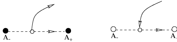
FIGURE 2. A neighborhood of a bifurcation point in W_\rho .

has the opposite sign of the inner product \langle L'(v), x \rangle , where v is the oriented vector tangent to W_\rho^r at ([A], 0) . From part (ii) of the lemma, it follows that \langle L'(v), x \rangle has the same sign as the derivative of the path of (multiplicity two) eigenvalues of K(A + ra, \rho_{r\tau}) which crosses zero at r = 0 . Figure 2 illustrates what this means in terms of spectral flow. Here W_\rho^r is the dotted line and W_\rho^* the solid one. In the diagram on the left, Sf_{\mathfrak{h}^\perp}(A_-, A_+) = -2 and in the one on the right, Sf_{\mathfrak{h}^\perp}(A_-, A_+) = 2 .