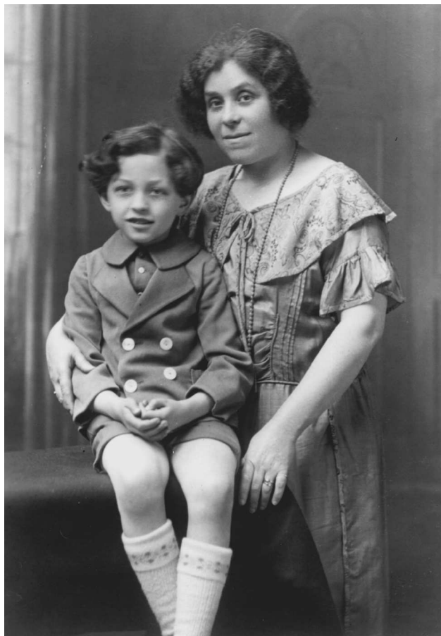
FIG. 1. Young I. J. Good and his mother.

When I was nearly 10, I was in bed with diphtheria (that's a disease of course, not a girl—unfortunately). I worked on trying to extract the square root of 2. My sister had shown me how to extract square roots by the method resembling long division, bringing down two digits at a time. And when I'd reached about 10 or 12 places, I squared the result and of course I got something like one